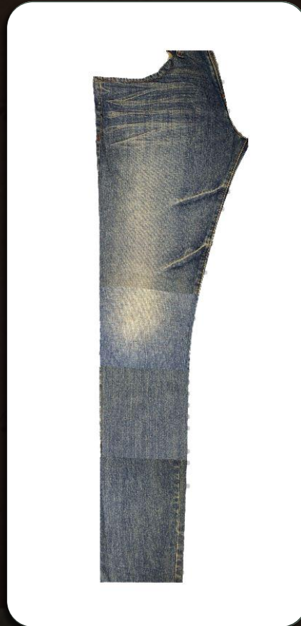
Denim jean pattern layout

Build the jean by placing your scan and photo imagery into the garment pattern